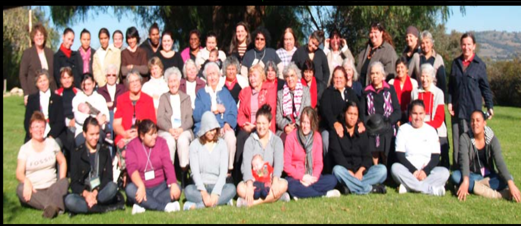
AEF EASTERN AREA LADIES CONVENTION 2010